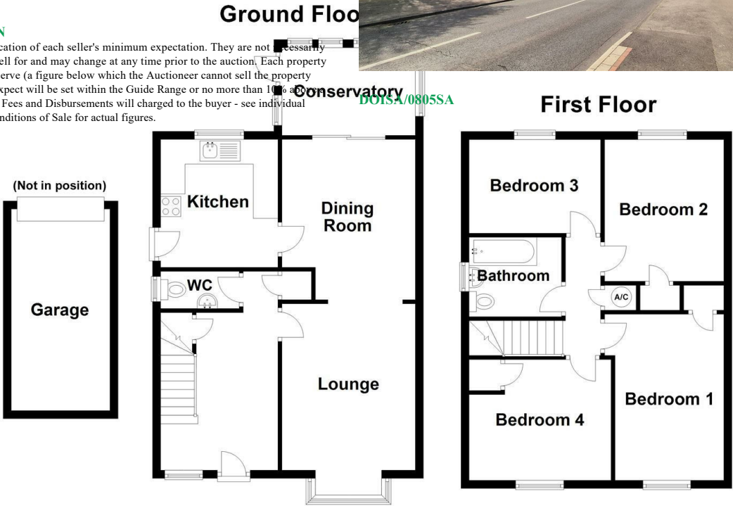
Not to scale. For illustrative purposes only

You may download, store and use the material for your own personal use and research. You may not republish, retransmit, redistribute or otherwise make the material available to any party or make the same available on any website, online service or bulletin board of your own or of any other party or make the same available in hard copy or in any other media without the website owner's express prior written consent. The website owner's copyright must remain on all reproductions of material taken from this website.